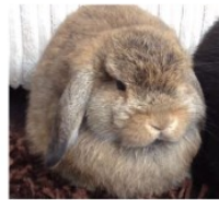
Alivia Block Best Opposite Variety Solid Mini Lop