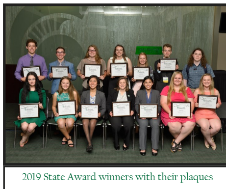
2019 State Award winners with their plaques

Michigan 4-H true leaders ages 11 and older have an opportunity to be recognized for the great work they do in 4-H and develop their career skills by completing a state award application. A Michigan 4-H State Award is the highest honor bestowed on a Michigan 4-H member and provides an opportunity to receive recognition for their engagement in rich learning experiences that result in outstanding knowledge and life-skill development.